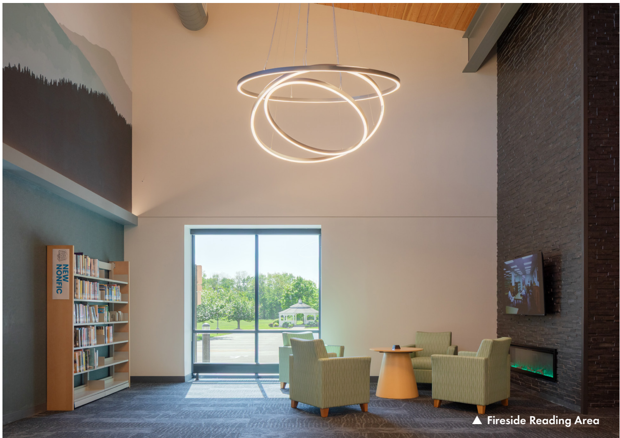
▲ Fireside Reading Area