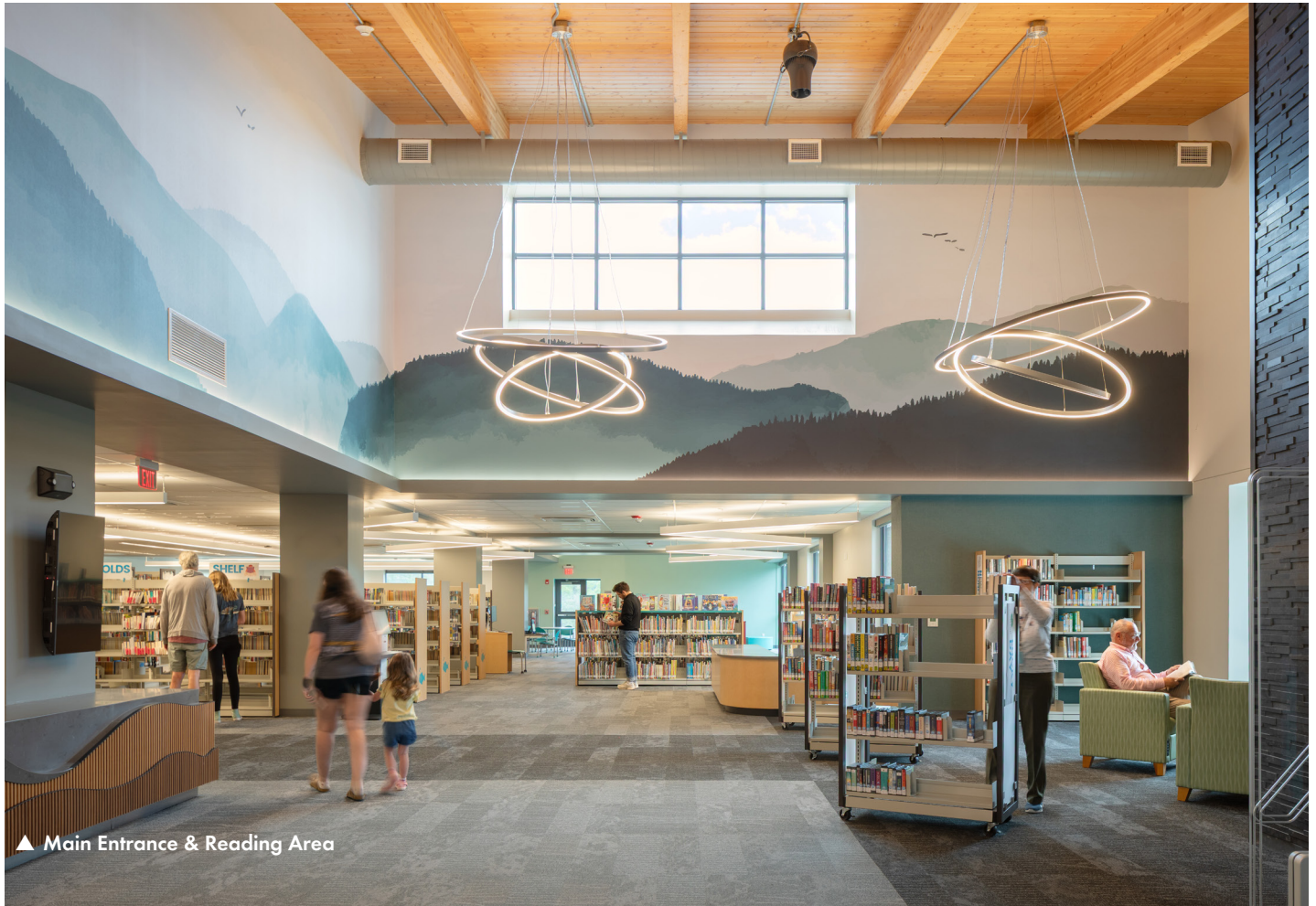
▲ Main Entrance & Reading Area