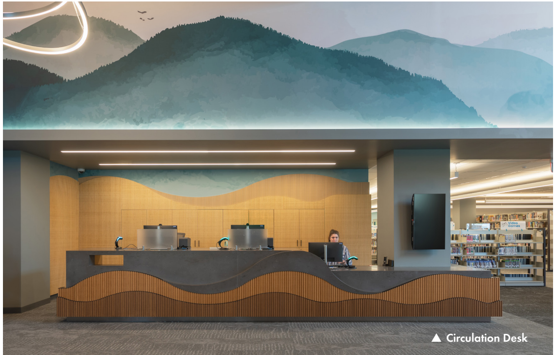
▲ Circulation Desk