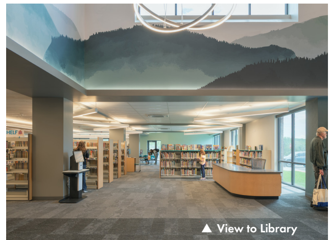
▲ View to Library

The former layout of this single-story, pre-engineered metal building, originally designed as office space, was inefficient for its use. The re-design incorporates a new layout for improved circulation, with logical adjacencies that enhance new programmatic functionality at double-height clerestory areas delineating spaces for adults, teens and children.