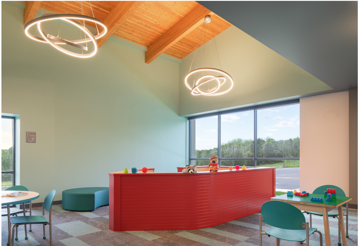
▲ Abundant natural light illuminates the childrens area