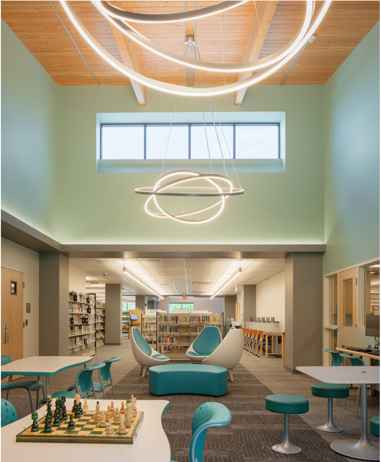
▲ A collaborative library corner beneath a soaring ceiling